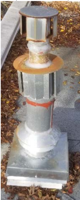
Figure 3: Visual Inspection of Vent Pipe is NOT Sufficient .